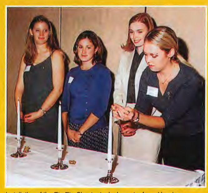
Installation of the Eta Eta Chapter took place at a formal luncheon.

The Fraternity will next install the Eta Iota Chapter at the University of San Diego, March 2 through 4.