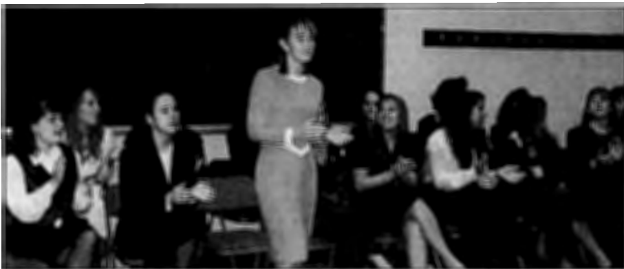
After the Loyalty Service, the Zeta Omicron Chapter learned new Theta songs and sang traditional Thymes Society songs.