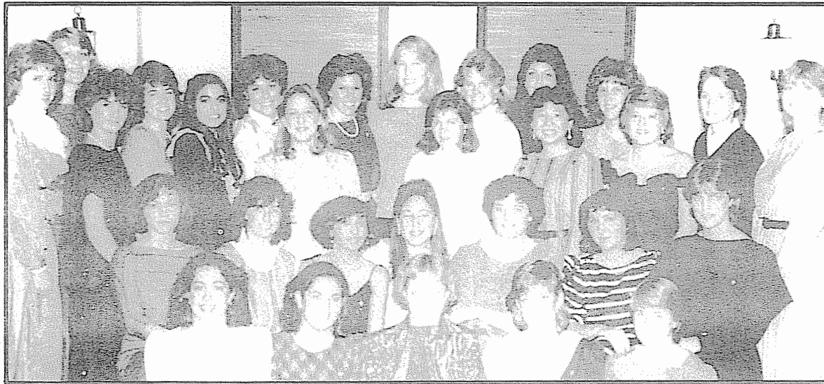
Epsilon Pi charter members gather together as new initiates of Kappa Alpha Theta's 106th chapter.