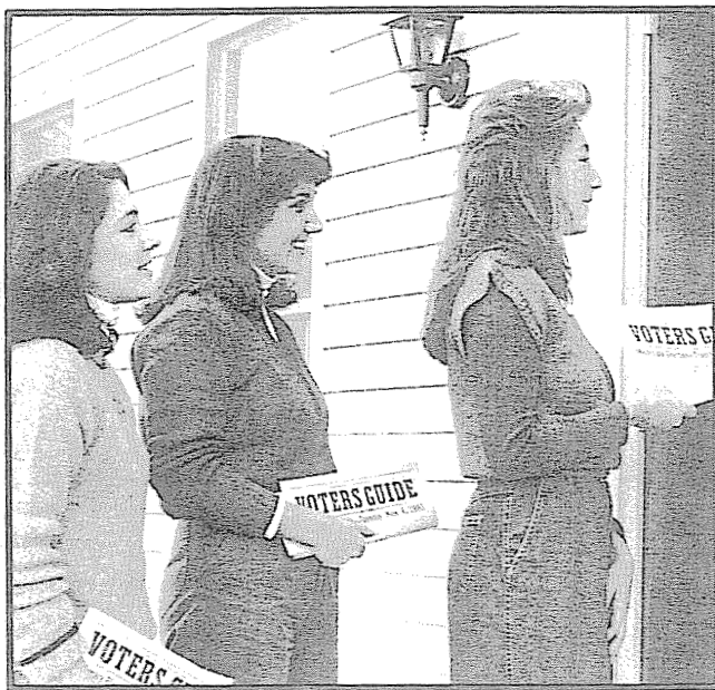
Bucknell charter members distributed voters' guides to the Lewisburg community for the League of Women Voters as their colony service project.

Twenty-nine enthusiastic charter members of Epsilon Pi proudly wore their badges following their installation November 16 through 18, 1984. As Kappa Alpha Theta installed its 106th chapter at Bucknell University in Lewisburg, Pennsylvania, the new initiates were welcomed into the bonds of sisterhood by Thetas from across the United States and Canada.