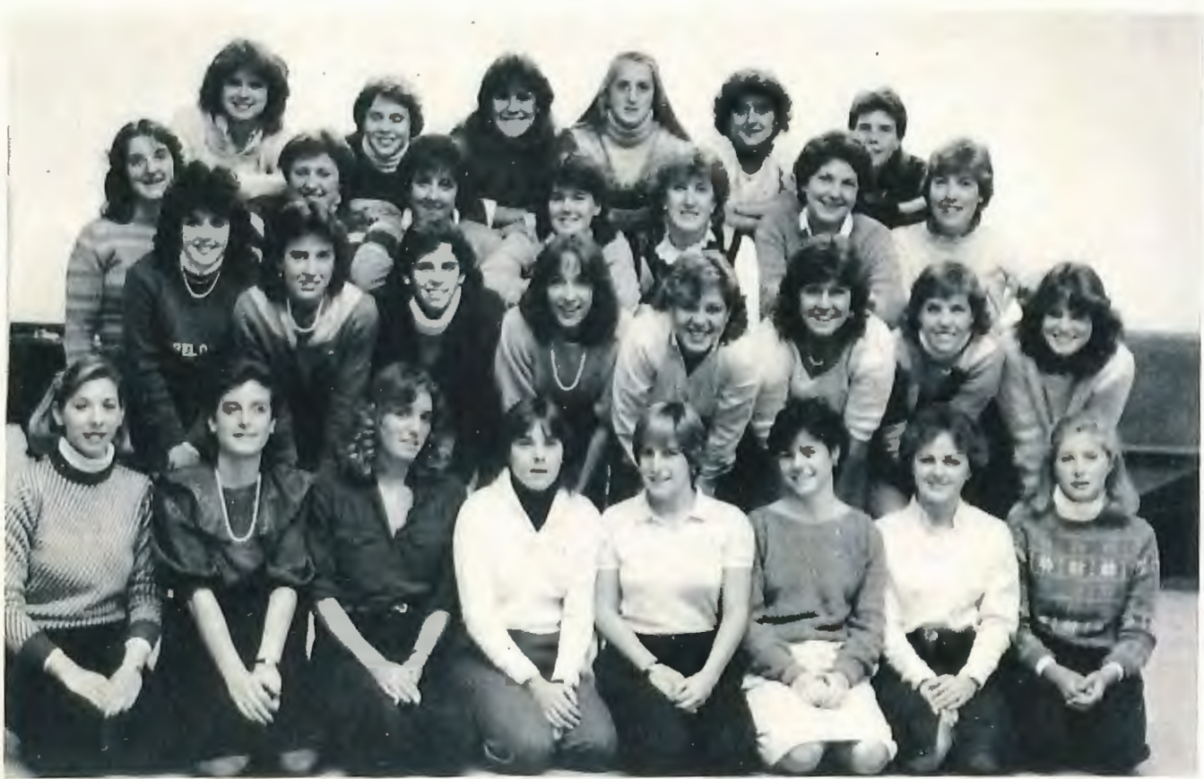
Charter members of Epsilon Xi at Villanova University