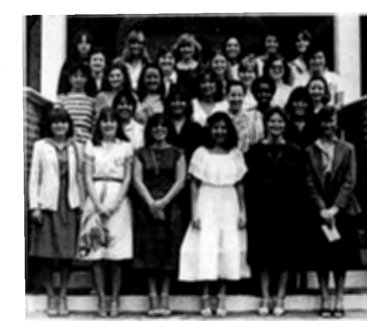
Charter members of Epsilon Theta