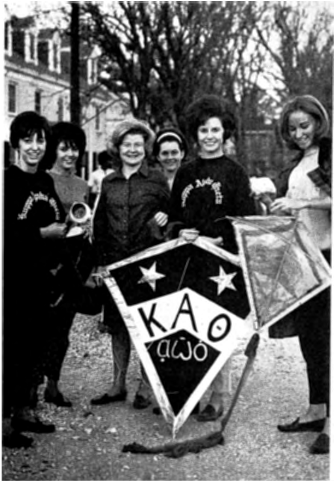
The Theta kite arrives at Arkansas.