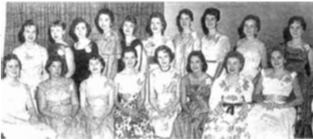
Kite Club alum initiates and three colonizers at Emory University. (Identification in accompanying article.)