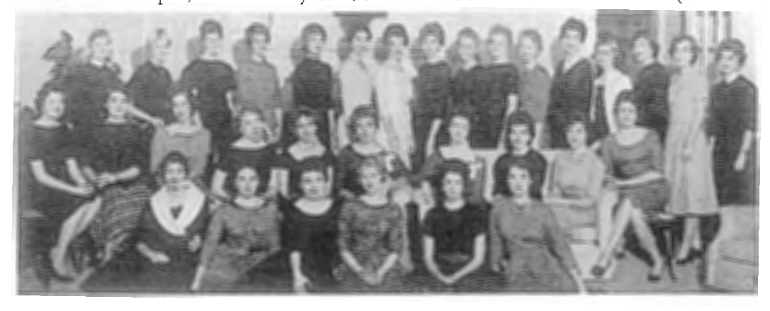
Newly initiated actives of Phi chapter. For names, see accompanying article.

Active members initiated were (listed accord-