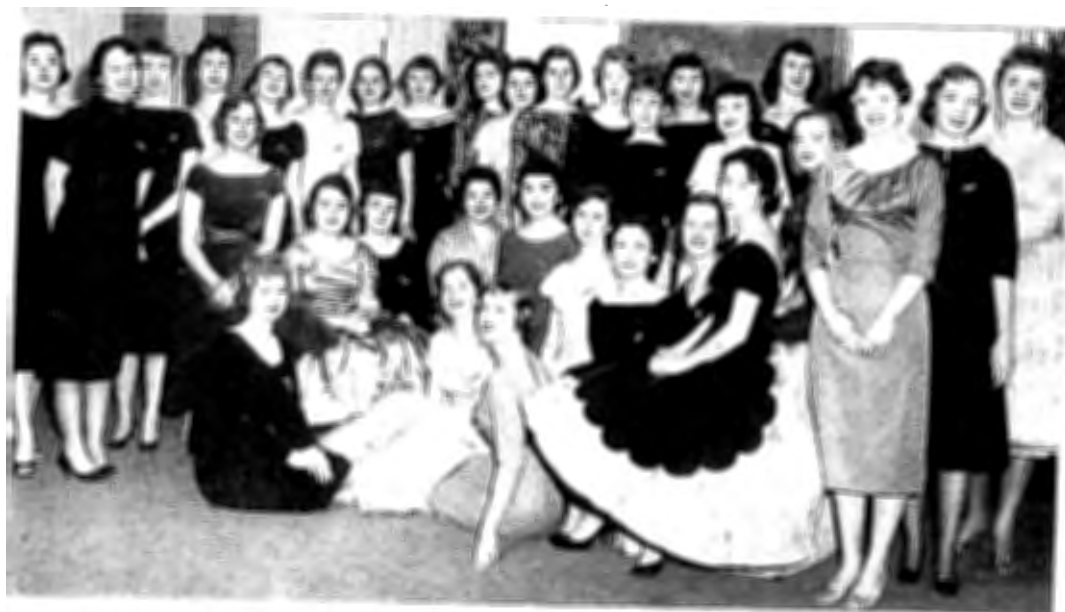
Nu actives and pledges line up to be counted and photographed before leaving tea at college president's home.